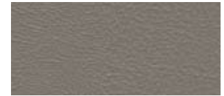
MEDIUM PEWTER VINYL Available with WT Trim