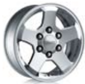
PP2 □ 16" □ ALUMINUM