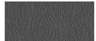
EBONY Standard on Extended and Crew Cab SLT Available on Extended and Crew Cab SLE-3