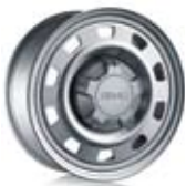
PP4 □ 16" □ STEEL