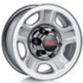
PP3 □ 16" □ STEEL