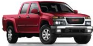
SONOMA RED METALLIC