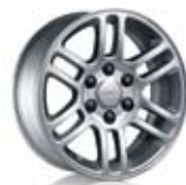
P67 □ 18" □ ALUMINUM WITH BRIGHT FINISH