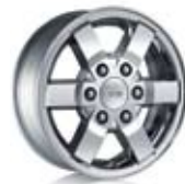
R02 □ 16" □ CHROME CLAD