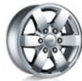
R03 □ 17" □ CHROME CLAD