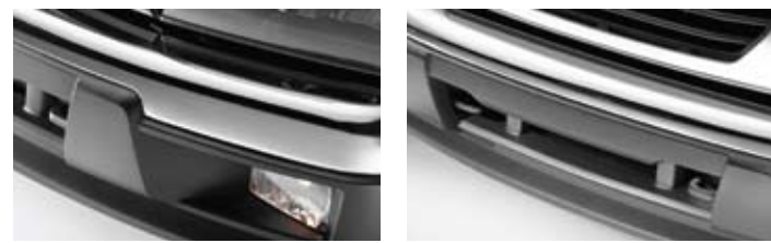
FOG LAMPS Front halogen fog lamps provide added visibility when you need it.