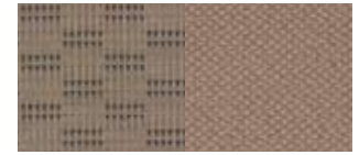
LIGHT TAN DELUXE Standard with SL and SLE Trim