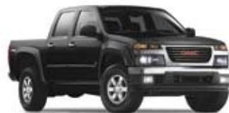
CARBON BLACK METALLIC** EXTRA-COST COLOR