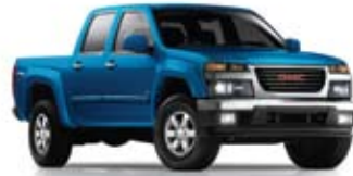
AQUA BLUE MARINE