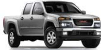
DARK STEEL GRAY METALLIC**