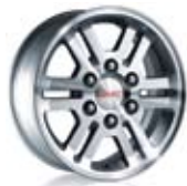
PP1 □ 16" □ ALUMINUM