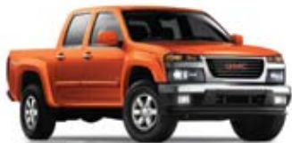
RED-ORANGE METALLIC EXTRA-COST COLOR