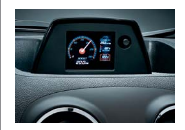
Available in SS Turbocharged, the Performance Display can be configured to display engine rpm, engine boost and more.