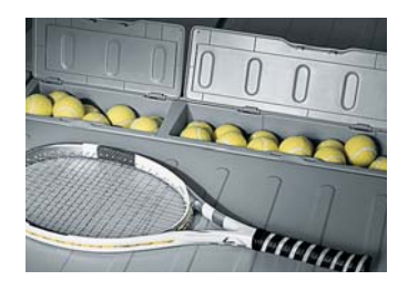
Rear storage areas, hidden underneath the floor, leave room on top for other items. Shown in Gray.