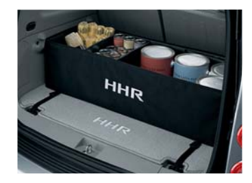
Available cargo organizer.