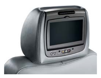
Available head restraint system features DVD/CD/MP3 player.