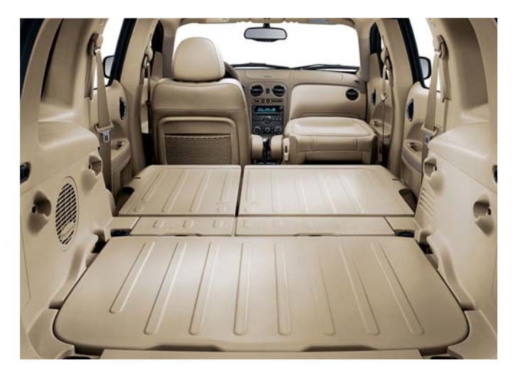
60/40 split-bench rear seats – standard in all HHR models – can fold flat to accommodate longer items. Shown in Cashmere.

1 HHR Panel models feature up to 62.7 cu. ft. of storage space. Cargo and load capacity limited by weight and distribution.