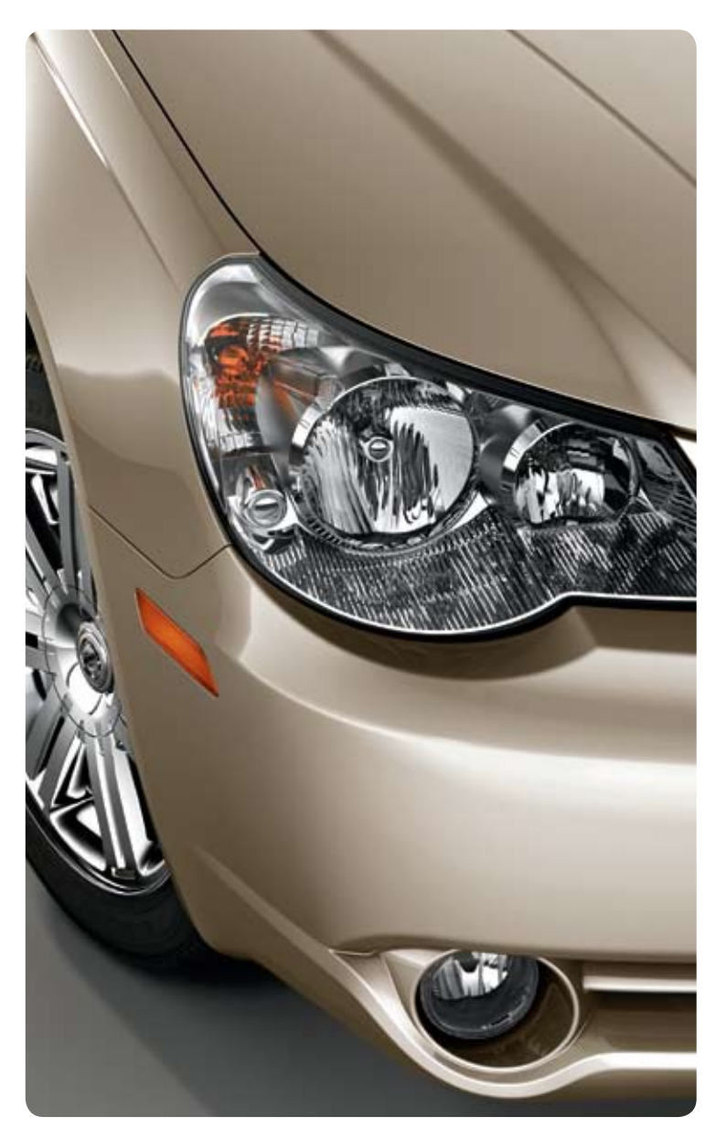
Sebring Limited in Light Sandstone Metallic.