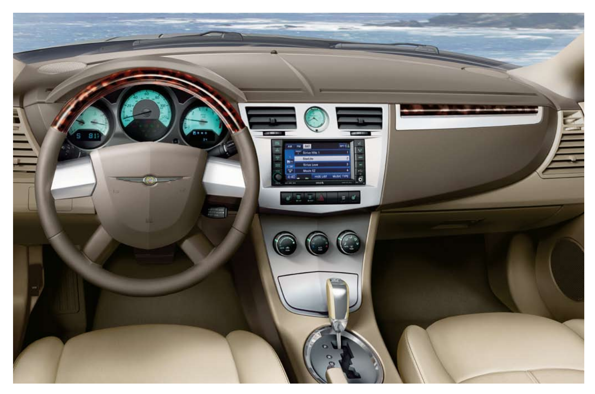
Sebring Limited instrument panel with Tortoiseshell-style and Satin Silver accents.