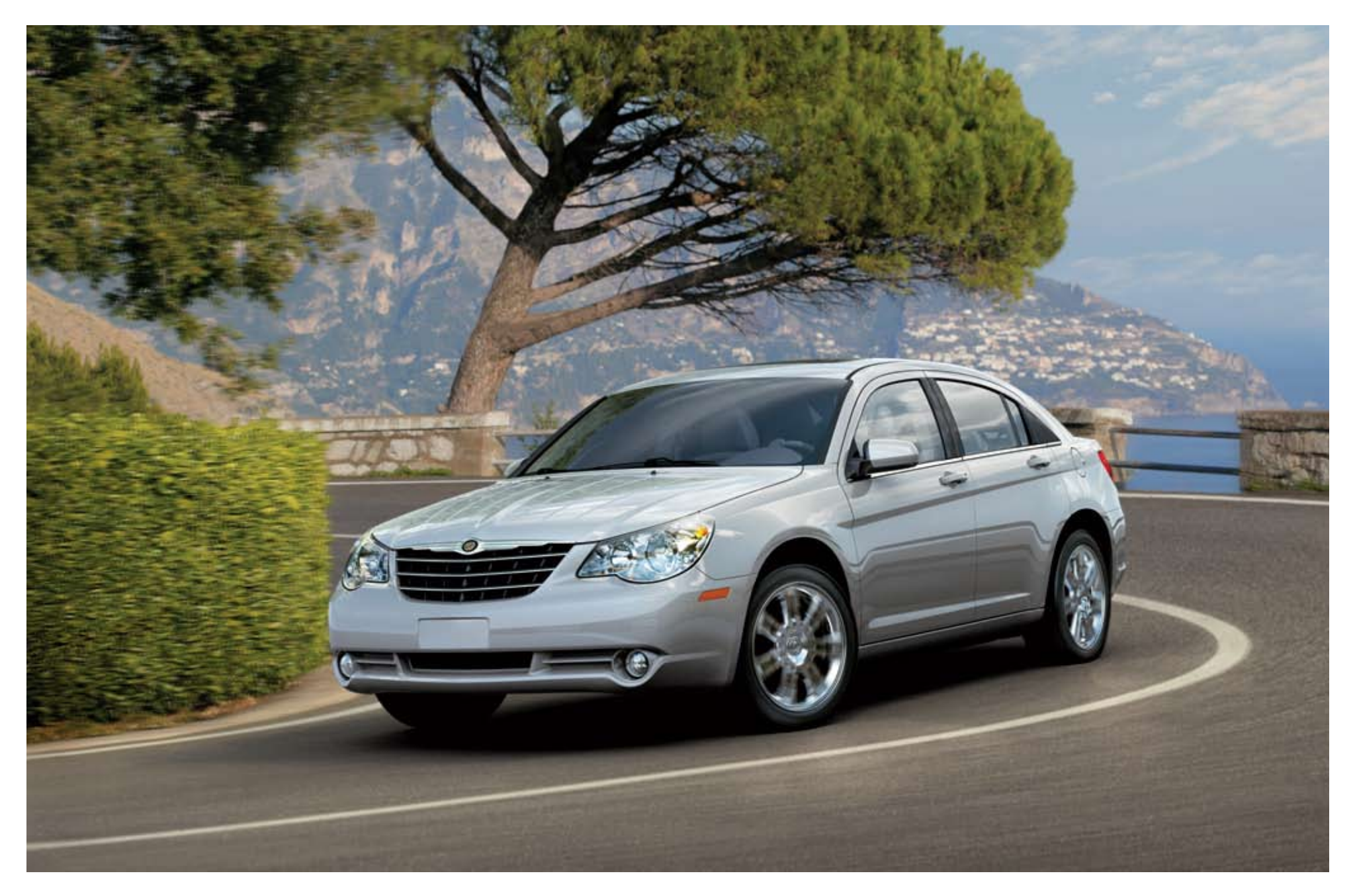
Sebring Limited in Bright Silver Metallic.