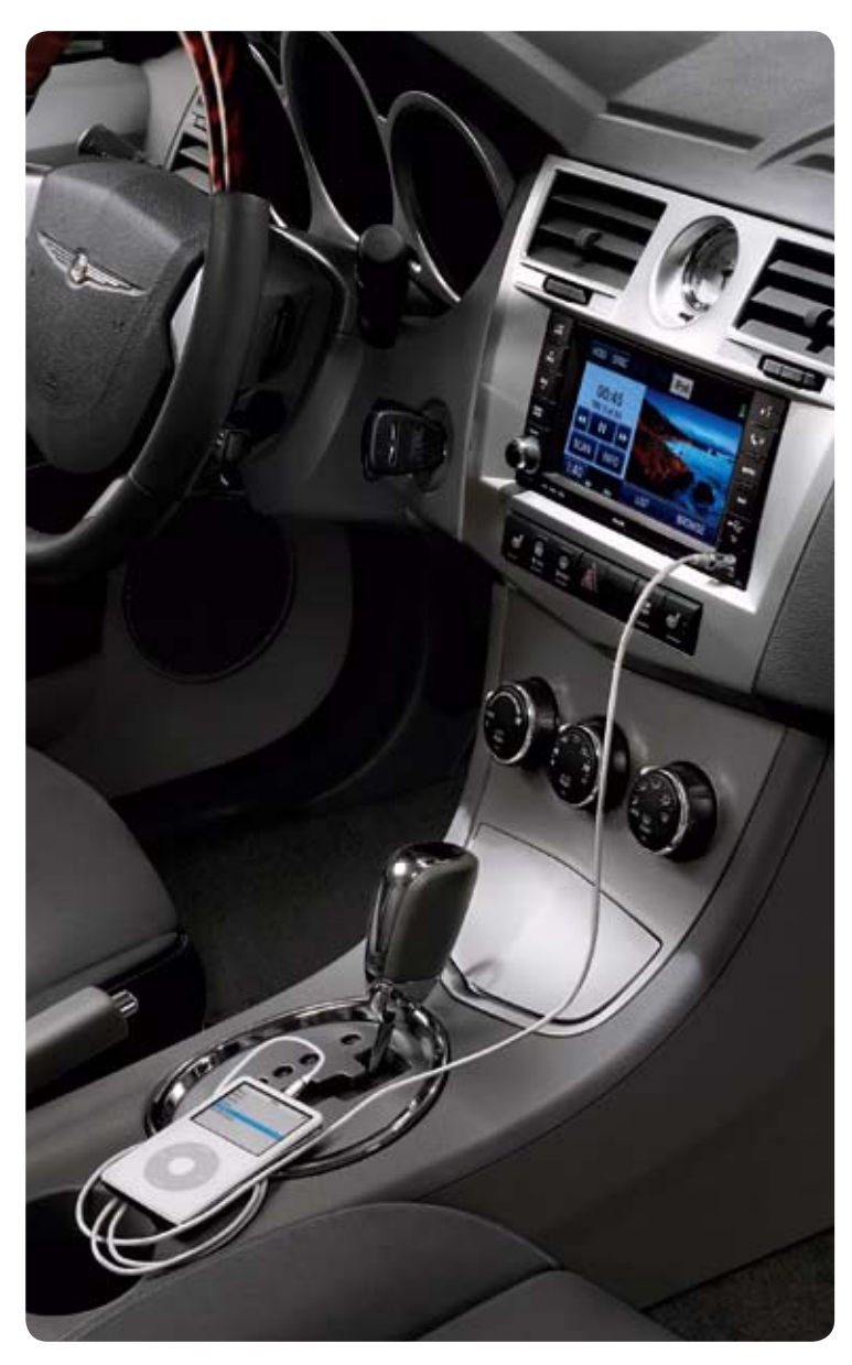
Sebring Limited interior in Dark Slate Gray Royale Leather trim.