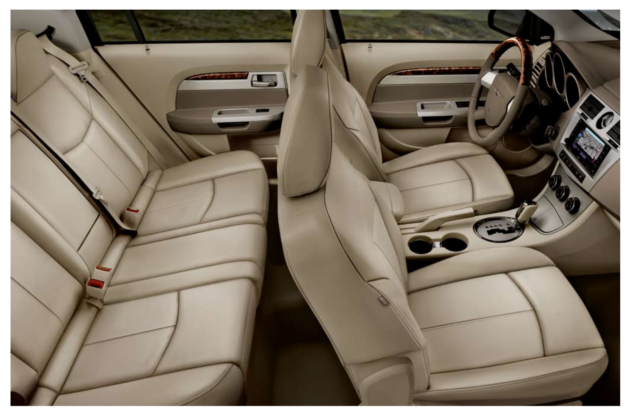
Sebring Limited interior in Medium Pebble Beige/Cream with Tortoiseshell-style and Satin Silver accents.