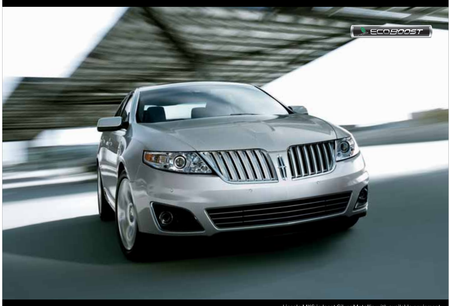
Lincoln MKS in Ingot Silver Metallic with available equipment.