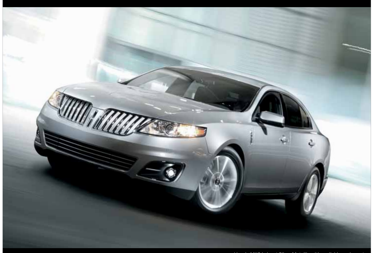
Lincoln MKS in Ingot Silver Metallic with available equipment.