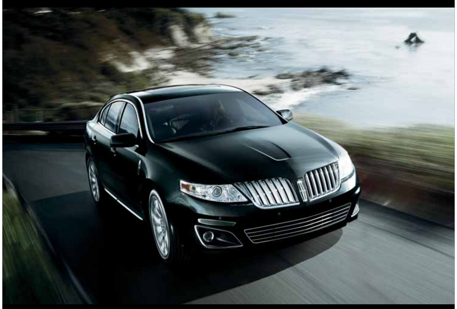
Lincoln MKS in Tuxedo Black Metallic with available equipment.