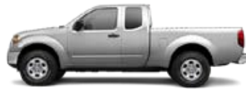
SE V6: KING CAB AND CREW CAB