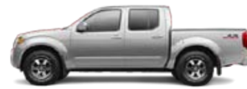
PRO-4X: KING CAB AND CREW CAB