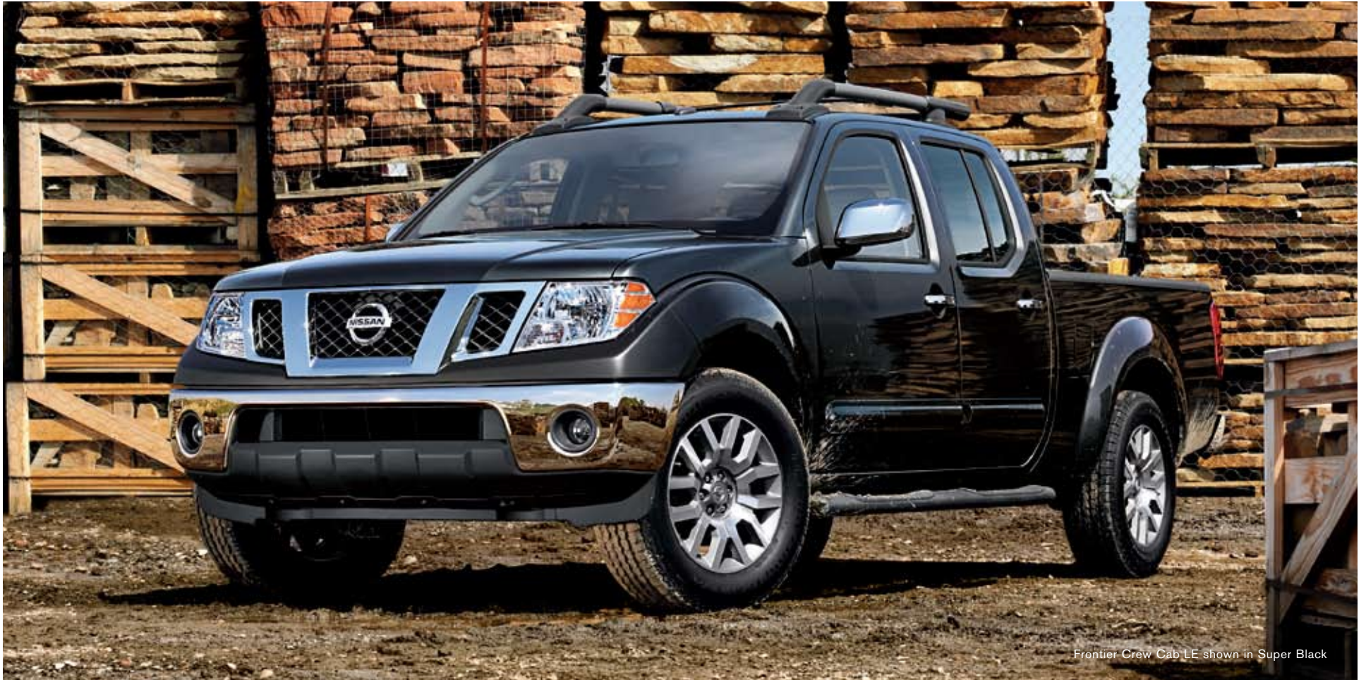
Frontier Crew Cab LE shown in Super Black