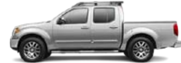
LE: KING CAB AND CREW CAB