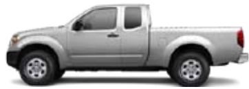
XE AND SE 4-CYLINDER: KING CAB