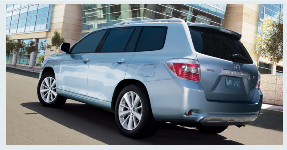
Highlander Hybrid shown in Wave Line Pearl with available Extra Value Package #2 and accessory roof rail cross bars