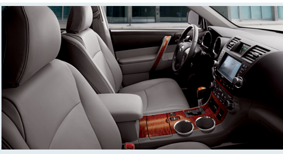
Limited shown in Ash leather trim with available Extra Value Package #2