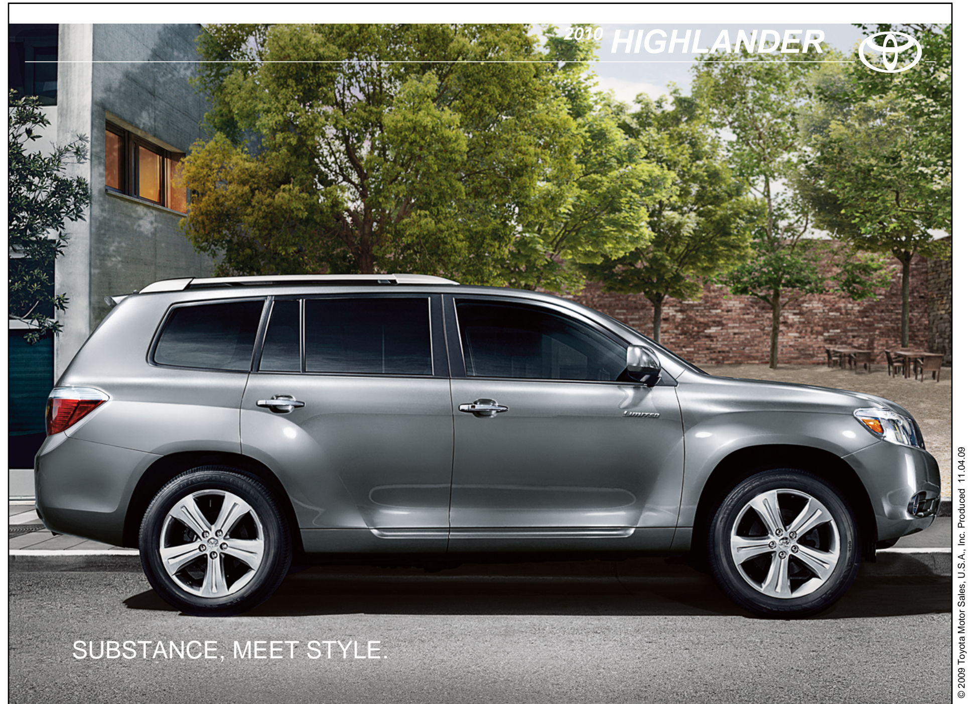
PAGE 1 of 22