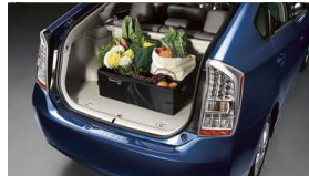
Cargo tote by Nifty Products $40 Installed MSRP*