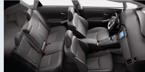
Prius interior shown in Dark Gray leather with available Advance Technology Package [28]