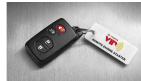
Remote engine start $529 Installed MSRP*