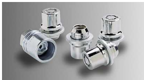
Wheel locks (alloy) $67 Installed MSRP*