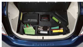
Cargo Organizer $49 Installed MSRP*