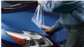
Paint protection film $395 Installed MSRP*