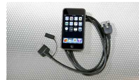
iPod Interface $299 Installed MSRP*