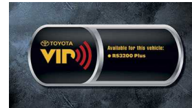
VIP RS3200Plus Security System $359 Installed MSRP*