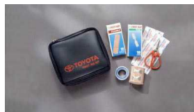
First aid kit $29 Installed MSRP*