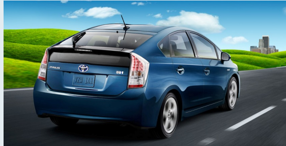
Prius V shown in Blue Ribbon Metallic with available Advanced Technology Package [28]