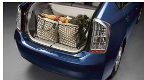
Cargo Net $51 Installed MSRP*