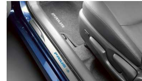
Illuminated door sill $359 Installed MSRP*