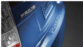
Rear bumper applique $69 Installed MSRP*