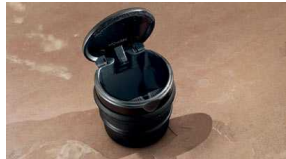
Ashtray Cup $17 Parts Only MSRP**