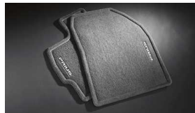
Carpet Floor Mats & Cargo Mat $200 Installed MSRP*