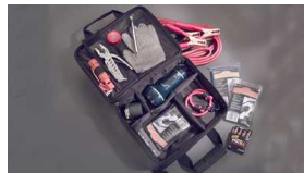
Emergency assistance kit $70 Installed MSRP*