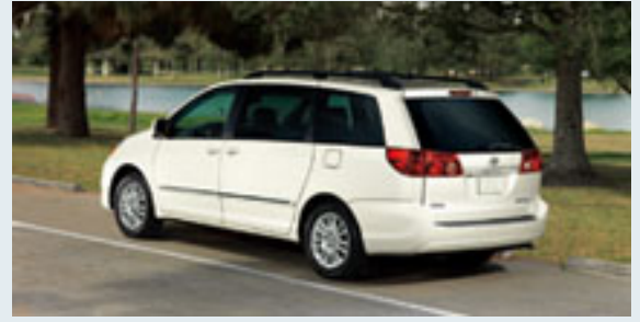
Limited shown in Blizzard Pearl