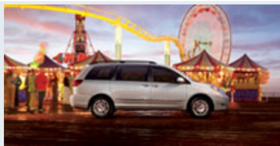
Limited shown in Silver Shadow Pearl