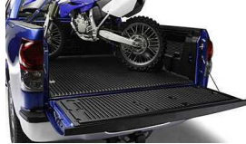
Bedliner w/o Deck Rail System $345 Installed MSRP*