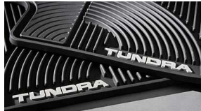
All Weather Floor Mats w/ Door Sill Protector $165 Installed MSRP*