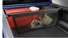
Cargo Divider $345 Installed MSRP*