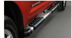
Stepboards Brushed Stainless Steel $624 Installed MSRP*