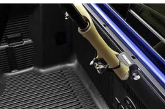
Locking Bike Fork Attachment $95 Installed MSRP*