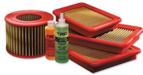
TRD Performance Air Filter $90 Installed MSRP*