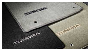
Carpet Floor Mats $115 Installed MSRP*