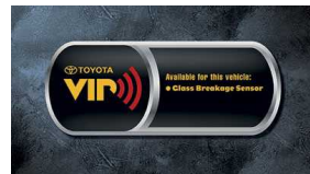
Glass Breakage Sensor (GBS) $165 Installed MSRP*