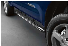
Tube Steps - Chrome $534 Installed MSRP*