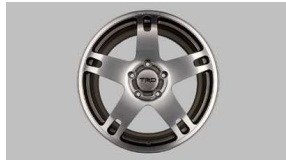
TRD 22"x9" 5-Spoke Polished Forged Aluminum Alloy Wheel $4,699 Installed MSRP*