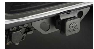
Tow Hitch w/ 7 Pin Connector $920 Installed MSRP*