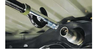
Spare Tire Lock $73 Installed MSRP*