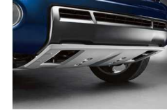
Front Skid Plate $425 Installed MSRP*