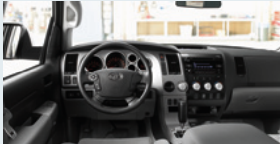
Double Cab Tundra interior shown in Graphite.