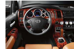
Molded Simulated Burlwood Dash Applique by Superior Dash $350 Installed MSRP*