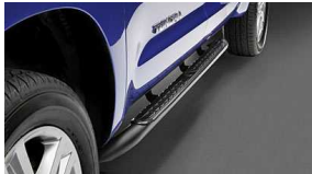
Tube Steps - Black $490 Installed MSRP*