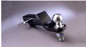
Ball Mounts $65 Parts Only MSRP**