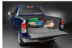
Bed Rug $409 Parts Only MSRP**