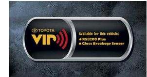
VIP-RS3000 Plus Security System $299 Installed MSRP*