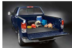
Bed Mat $127 Installed MSRP*