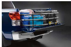
Bed Extender $320 Installed MSRP*