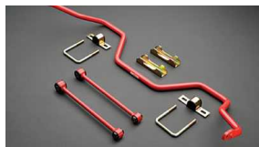
TRD Rear Sway Bar $299 Installed MSRP*