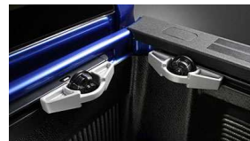
Deck Rail System w/4 Tie Down Cleats $210 Installed MSRP*