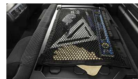
Seat Back Cargo Net $64 Installed MSRP*