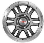
TRD 17" x 8" 6 Split Spoke Forged Off-road Wheel w/ Beadlock Styling $3,199 Installed MSRP*