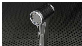
Anodized Aluminum Shift Knob $85 Installed MSRP*