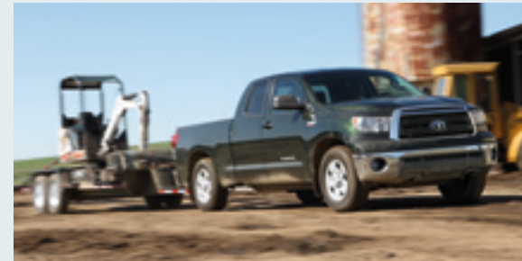
4x2 Double Cab standard bed shown in Spruce Mica with available 5.7L V8, tow package, fog lamps, mudguards and 18-inch styled steel wheels [14].