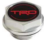
TRD Forged Oil Cap $45 Parts Only MSRP**