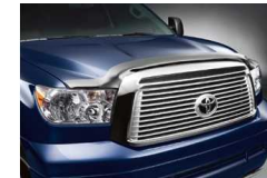
Hood Protector $165 Installed MSRP*