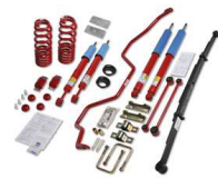
TRD Performance Handling Kit $1,699 Installed MSRP*