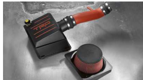
TRD Performance Air Intake $475 Parts Only MSRP**