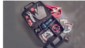
Emergency Assistance Kit $70 Installed MSRP*