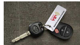
Remote Engine Start $529 Installed MSRP*