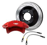
TRD High Performance Brake Kit $2,895 Installed MSRP*