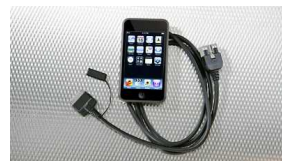
Interface Kit for iPod® $299 Installed MSRP*