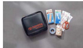
First Aid Kit $29 Installed MSRP*