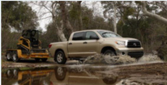
4x4 Crewmax Tundra shown in Sandy Beach Metallic with available 4.6L V8, fog lamps and 18-inch alloy wheels.