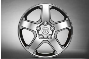
20" Machined Star 5 Spoke Wheel $1,585 Installed MSRP*