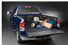
Bedliner w/Deck Rail System $365 Installed MSRP*