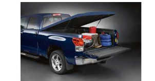
Tonneau Cover $1,545 Installed MSRP*