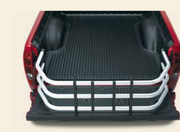
STRETCH THE BED CARGO capacity with this bed extender.