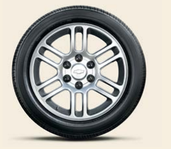
NEW 18-INCH MIDNIGHT SILVER. Standard on 2WD Sport models.