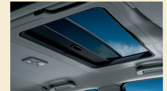
A POWER SUNROOF is available on Extended and Crew Cab models. The sunroof can be tilted up or fully opened with the touch of a button.

(XMI)) XM RADIO WITH THREE TRIAL MONTHS<sup>1</sup> turns your world on with commercial-free music channels from rock to jazz, country to classical, Latin pop to hip-hop, and virtually everything in between – all in amazing digital sound.