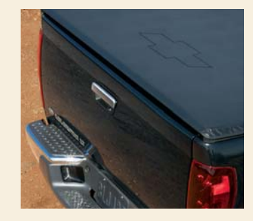
A SOFT TONNEAU COVER helps keep the elements and onlookers from valuable cargo items.