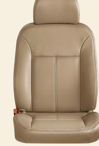
LIGHT CASHMERE LEATHER