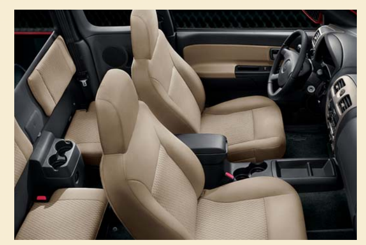
COLORADO EXTENDED CAB SPORT interior shown in Light Cashmere with Deluxe Cloth seats.

1 2WD EPA estimated MPG 15 city, 21 highway.