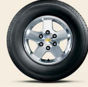
NEW 16-INCH ALUMINUM. Standard on 2WD Z85 models.