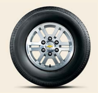
NEW 16-INCH ALUMINUM Standard on 4x4 Z85 models.