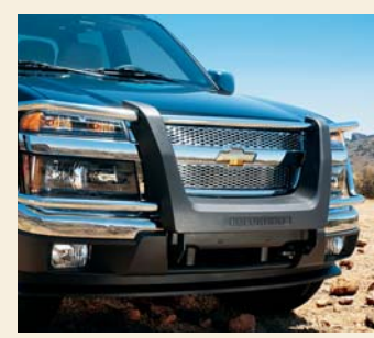
A BRUSH GRILLE GUARD adds a layer of protection and makes a bold statement.

Make Colorado your own by adding the available dealer-installed Chevy Accessories that are specifically designed to enhance each model's AGGRESSIVE STYLING and functionality. | Include some flash with chrome stainless steel tubular assist steps, chrome grille inserts and chrome surrounds, as featured on this page. | Order your Colorado with DEALER-INSTALLED CHEVY ACCESSORIES, and they'll be covered by the GM 3-year/36,000-mile (whichever comes first) New Vehicle Limited Warranty. Accessories installed after delivery include a 12-month/12,000-mile (whichever comes first) limited warranty. | See your dealer for more warranty information. For a complete list of dealer-installed Chevy Accessories, go to chevy.com/colorado/accessories for details.