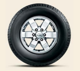
NEW 17-INCH CHROME-CLAD. Standard on Z71 models.