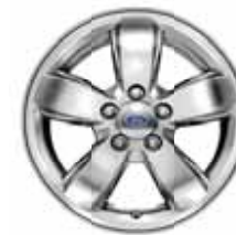
17" Chrome-Clad Aluminum Optional on XLT and Limited