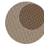
Camel Cloth with Dark Camel Inserts Standard on XLT