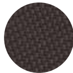
Premium Greystone Cloth Standard on XLT and Hybrid (Stone interior)