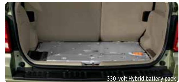
330-volt Hybrid battery pack