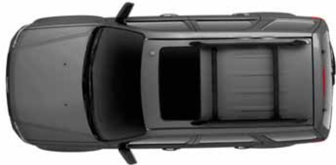
Sterling Grey Metallic