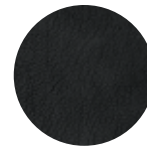
Charcoal Black Leather Standard on Limited; Optional on XLT