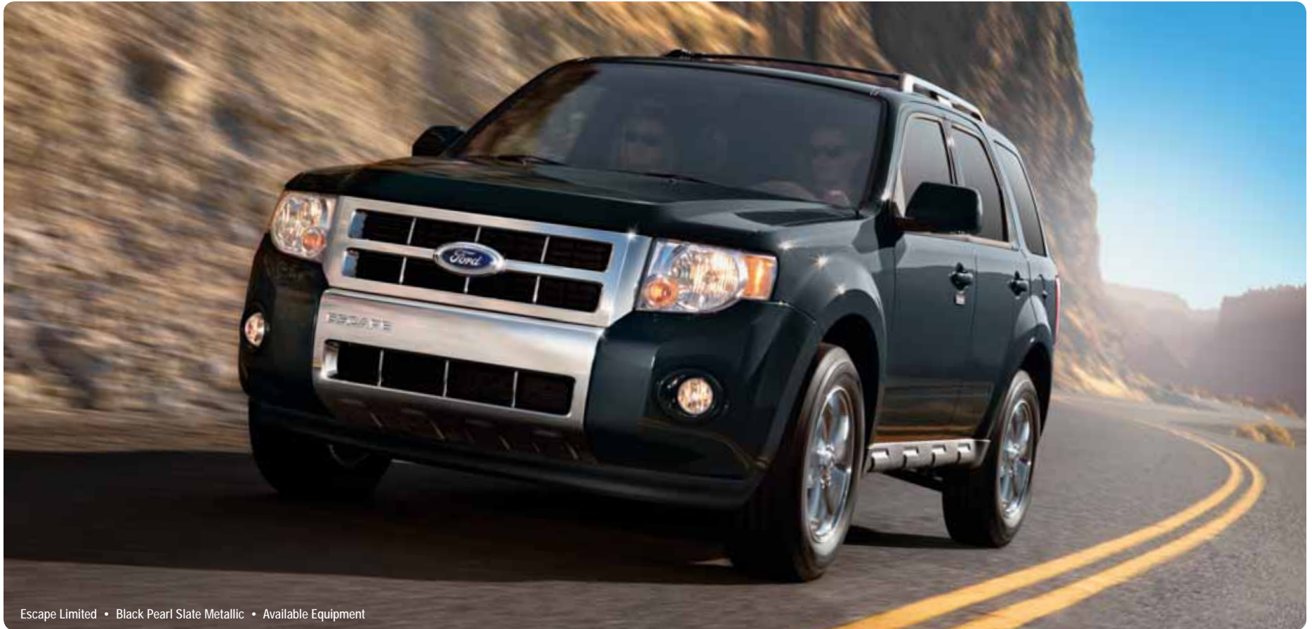
Escape Limited • Black Pearl Slate Metallic • Available Equipment