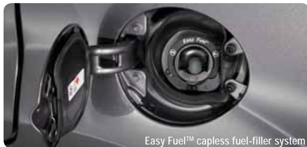
Easy Fuel™ capless fuel-filler system