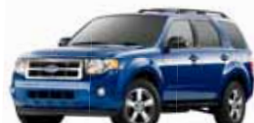
Sport Blue Metallic