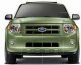
Kiwi Green Metallic