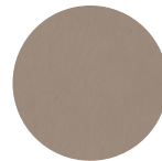
Camel Leather Standard on Limited; Optional on XLT