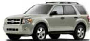
Light Sage Metallic