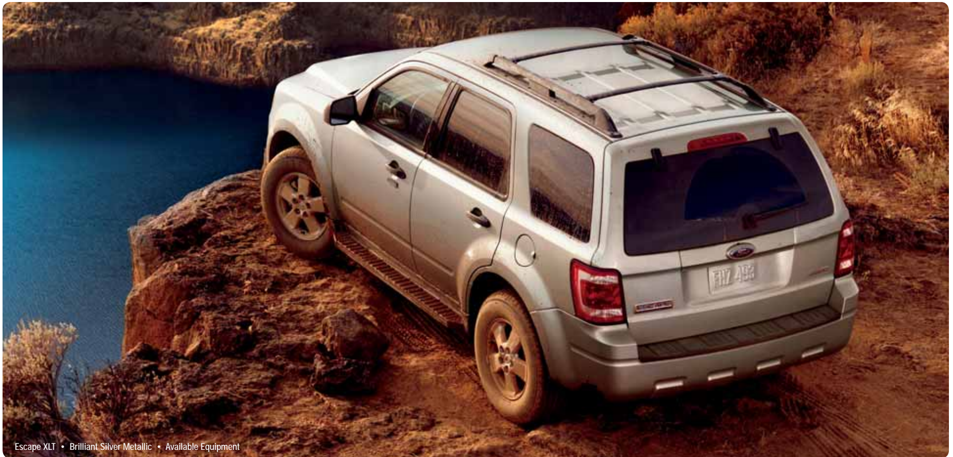
Escape XLT • Brilliant Silver Metallic • Available Equipment