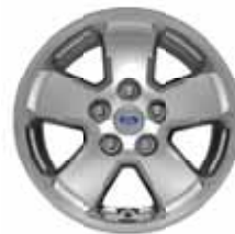
16" Cast-Aluminum Standard on XLS and XLT