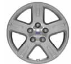
16" Cast-Aluminum Standard on Hybrid