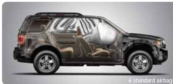
6 standard airbags