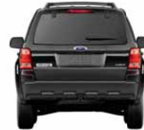
Black Pearl Slate Metallic