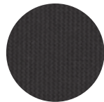
Greystone Cloth Standard on XLS Manual and XLS (Stone interior)