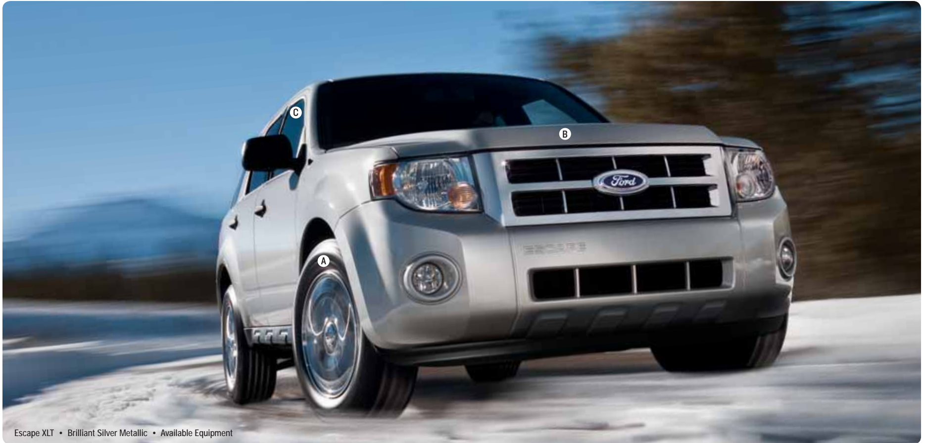
Escape XLT • Brilliant Silver Metallic • Available Equipment

Any road. Every road. I go with confidence.