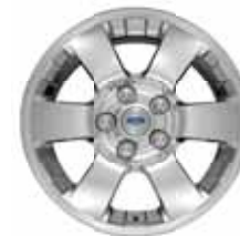
16" Bright Machined-Aluminum Standard on Limited and Hybrid Limited