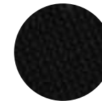
Charcoal Black Cloth Standard on XLT