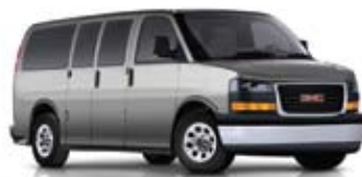
STEEL GRAY METALLIC EXTRA-COST COLOR