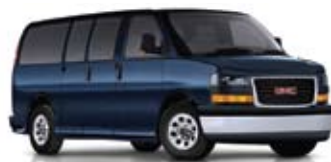
DEEP BLUE METALLIC EXTRA-COST COLOR