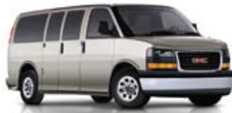
SILVER BIRCH METALLIC EXTRA-COST COLOR