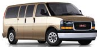
SAND BEIGE METALLIC EXTRA-COST COLOR