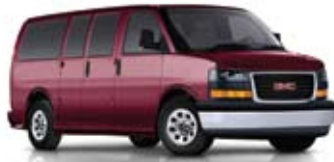
SPORT RED METALLIC EXTRA-COST COLOR