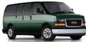
POLO GREEN METALLIC EXTRA-COST COLOR