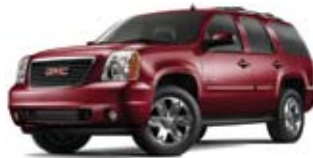
RED JEWEL TINTCOAT EXTRA-COST COLOR