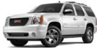
WHITE DIAMOND EXTRA-COST COLOR