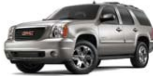
SILVER BIRCH METALLIC