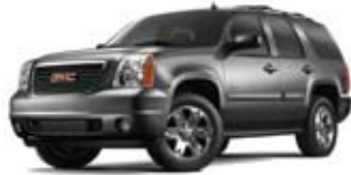
STEEL GRAY METALLIC