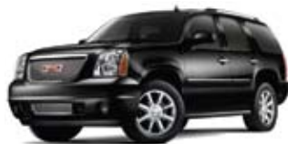
CARBON BLACK METALLIC EXTRA-COST COLOR