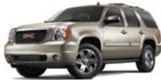
GOLD MIST METALLIC