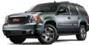
STEALTH GRAY METALLIC