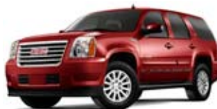
SONOMA RED METALLIC

OTHER AVAILABLE COLORS (ABOVE) ONYX BLACK STEALTH GRAY METALLIC SILVER BIRCH METALLIC SUMMIT WHITE