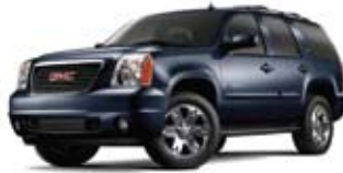
DEEP BLUE METALLIC