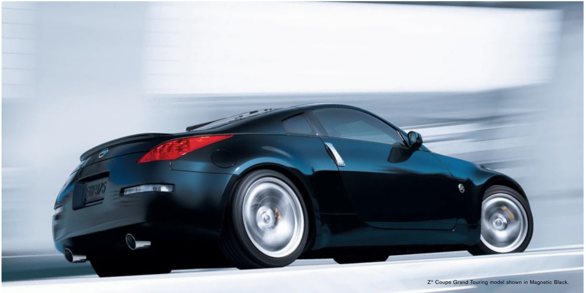
Z® Coupe Grand Touring model shown in Magnetic Black.