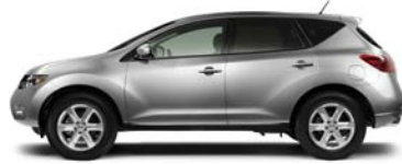
S: REDEFINITION OF ADVENTURE