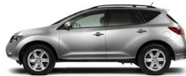
SL: STATEMENT OF BEAUTY