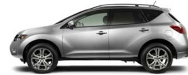
LE: PORTRAIT OF LUXURY