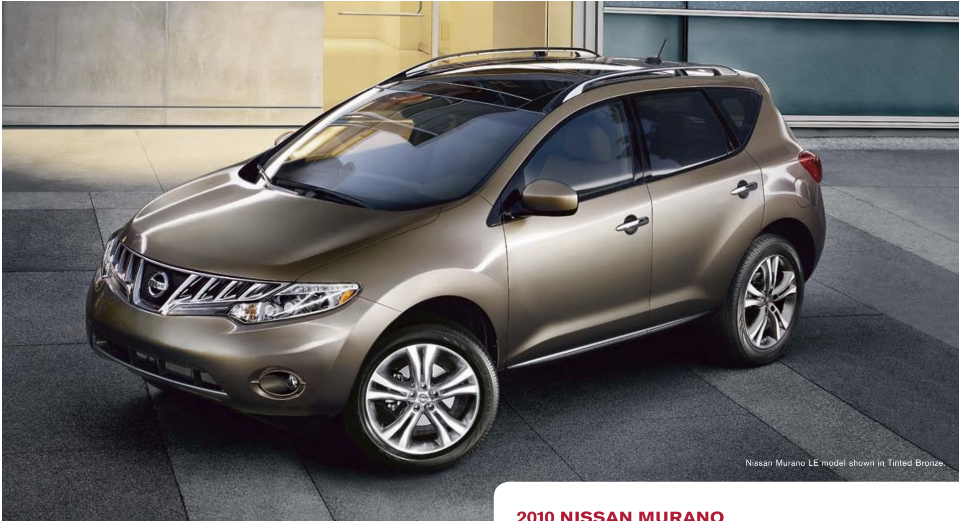
Nissan Murano LE model shown in Tinted Bronze.