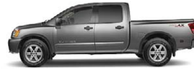
PRO-4X KING CAB AND CREW CAB