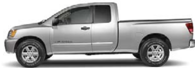
SE KING CAB AND CREW CAB