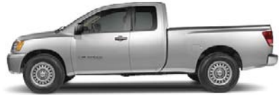
XE KING CAB AND CREW CAB