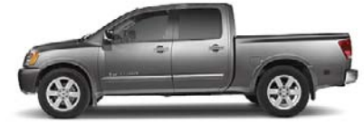
LE CREW CAB